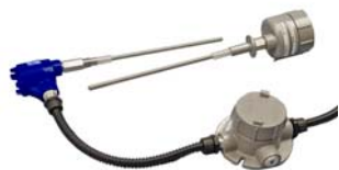
TRIBO.dsp U3400 Two-wire Monitor