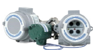
TRIBO.guard I 4001 Broken Bag Detector

Air Slide Flow Monitoring Lime & Powder Injection Catalyst Feed Injection Activated Carbon Injection Cyclone Flow and Overflow Pneumatic Conveying Flow/No Flow Detection Screw Conveyor Flow Fly Ash Handling Systems Particle Flow Velocity Gravity Feed Monitoring Vacuum Systems