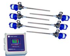
TRIBO.dsp U3800 Multi-channel Monitor