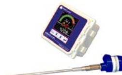
TRIBO.dsp U3600 Particulate Monitor